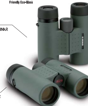
GENESIS/XD33 PROMINAR 10X33